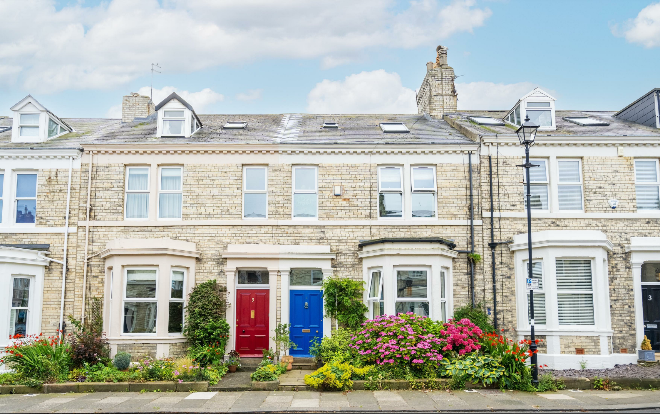
📍 Argyle Street, Tynemouth NE30 4EX